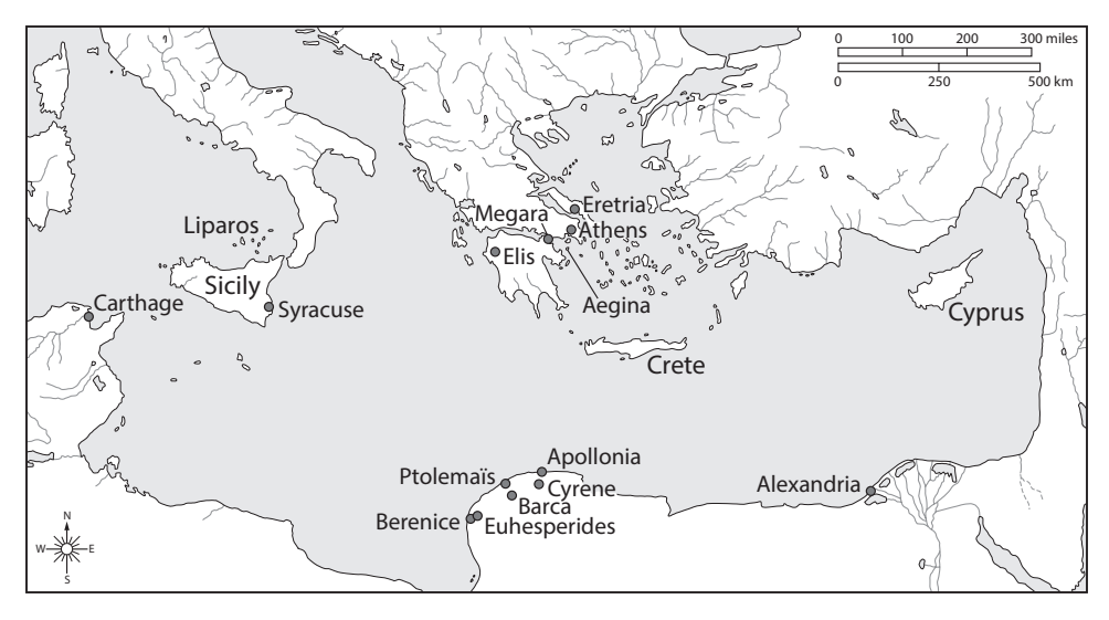
The world of the Cyrenaics.

movement was based in Cyrene. The six from elsewhere in the Greek-speaking Mediterranean show the international influence of the movement.<sup>10</sup>